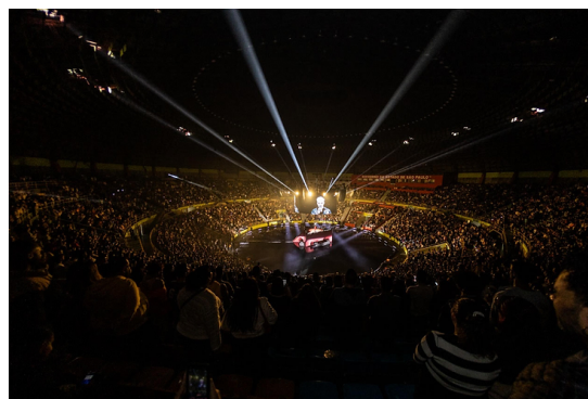
Fig. 3 Super audition with 12.000 fans. 2022. Ibirapuera Gymnasium.

When Jão released his album "SUPER", he decided to plan a free listening "party" to 12.000 fans and to the media one day before the album would be officially released in the mainstream - and it reached full capacity after only 2 minutes. It happened in the city of São Paulo at Ibirapuera Gymnasium.