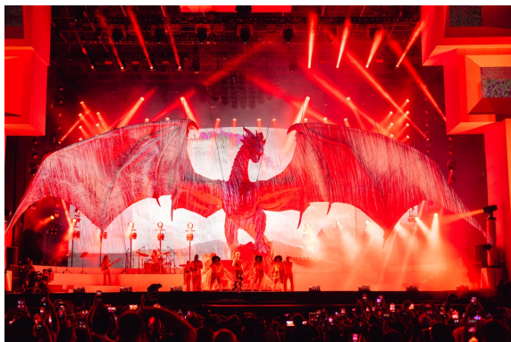
Fig. 4 The majestic dragon of his presentation at “The Town”. 2023.