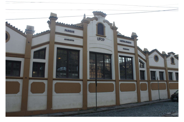
Fig. 3 – Façade of the Metallurgic Park Augusto Barbosa.

The second idea to highlight the industrial heritage in Ouro Preto is adaptive reuse. A more recent example is the Augusto Barbosa Metallurgic Park (Fig 3). In 1910, it was built as a large warehouse to store the goods which were brought by train. In 1946, the same building was converted into a pig iron factory, mechanical workshop, warehouse for storing raw materials and finished products. It was also used for academic activities for the National School of Mines and Metallurgy. In 1969, the complex became part of the Federal University of Ouro Preto (UFOP) which transformed it into a cultural, social, economic, and artistic space of integration. Its final use came in 1993, when UFOP decided to repurpose it into a venue for events, which was inaugurated in 2001.